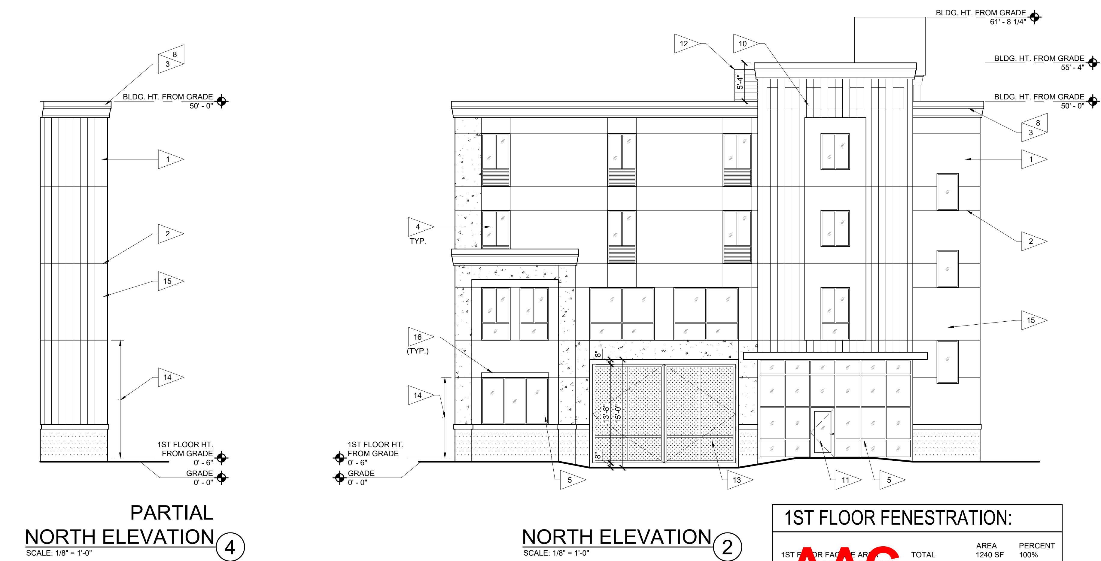
PARTIAL NORTH ELEVATION 4 SCALE: 1/8" = 1'-0"